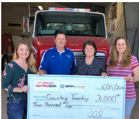
Alger Delta, Mich.

There is flexibility within funds with advance approval. For details, please check with your Energy Services Manager. Reimbursement forms and additional details are available on wppienergy.org