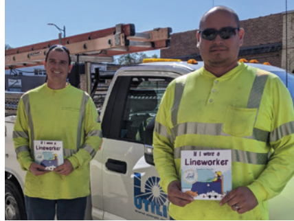
Lodi Utilities, Lodi, Wis.