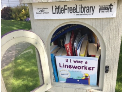
Two Rivers Water & Light, Two Rivers, Wis.